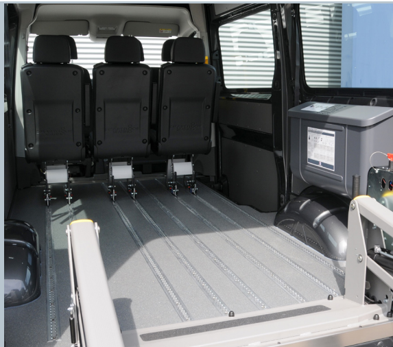
Smartfloor provides flexibility inside your vehicle.