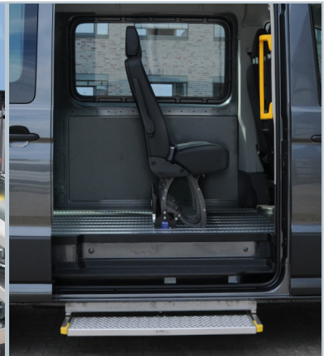
Step and grab handle at the side entry allow easy access to the passenger compartment.