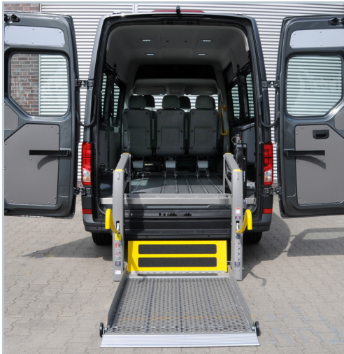
Wheelchair safely enters the vehicle via the lift.